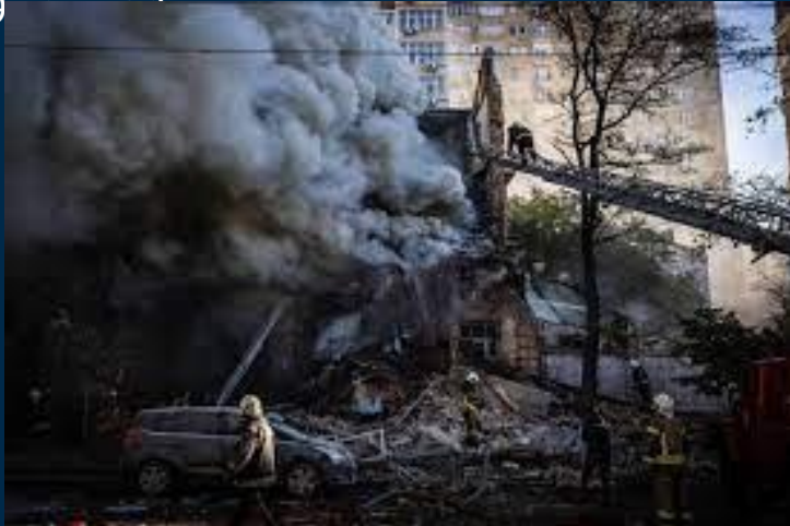
17 October 2022, the residential building and Kyiv cultural heritage, 4 killed, 18 injured