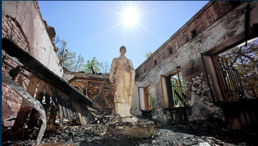
7 May 2022, National Skovoroda Museum in Skovorodnyvka, Kharkiv Region