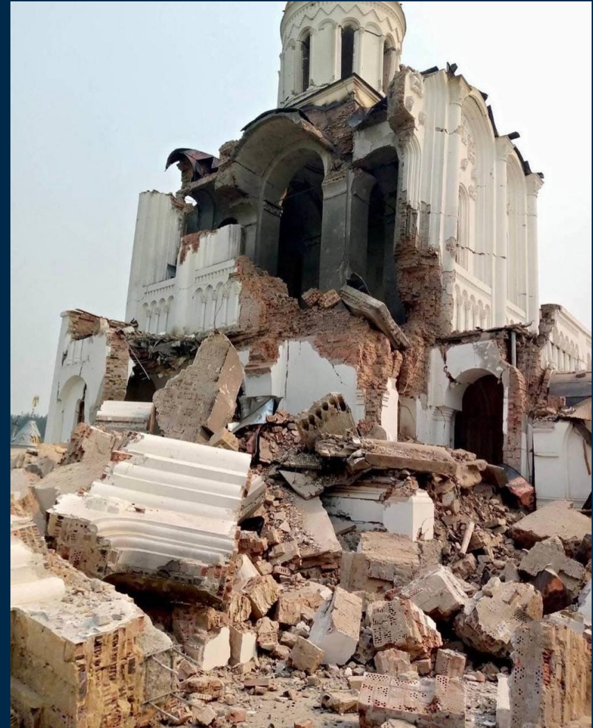
9 May 2022, Sviatogirska Church in Donetsk Region