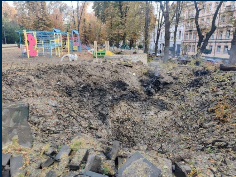
10 October 2022, children`s playground in the center of