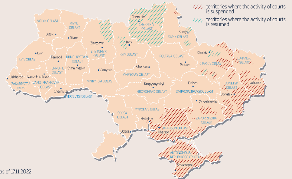
Territories of Ukraine where, in connection with the war, justice is not administered by courts of general jurisdiction*

(including temporary occupied territories of Luhansk, Donetsk Region and Crimea)