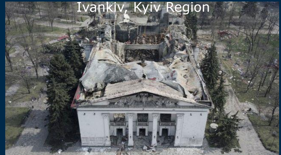
16 March 2022, drama theatre in Mariupol, Donetsk Region