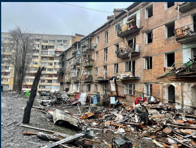
23 November 2022, the residential building in Vyshgorod, Kyiv Region, 7 killed, 35 injured