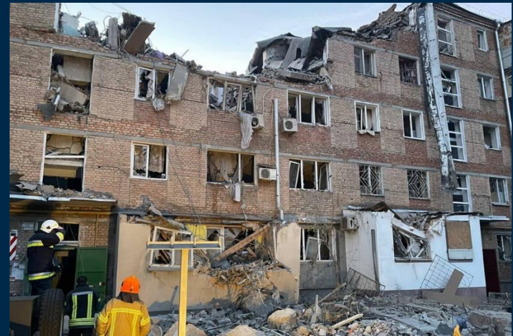
14 October 2022, the residential building in Mykolaiv, 7 killed