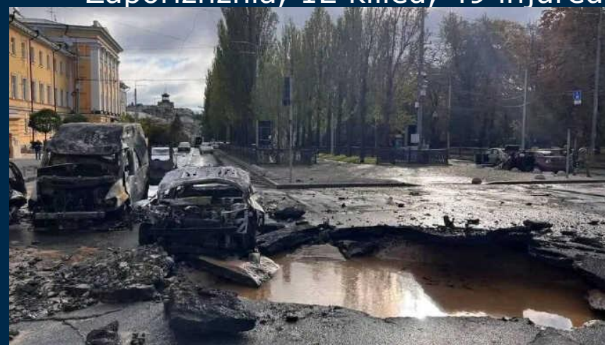
10 October 2022, Kyiv city center, 5 killed, 20 injured