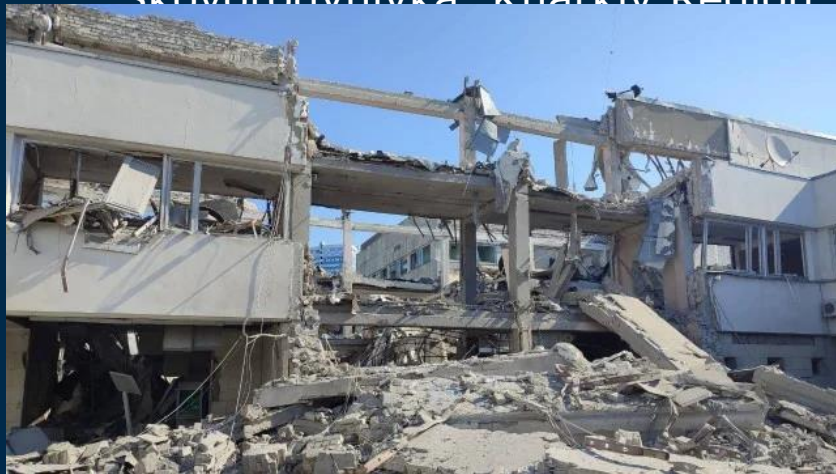
6 July 2022, National Pedagogical University in Kharkiv