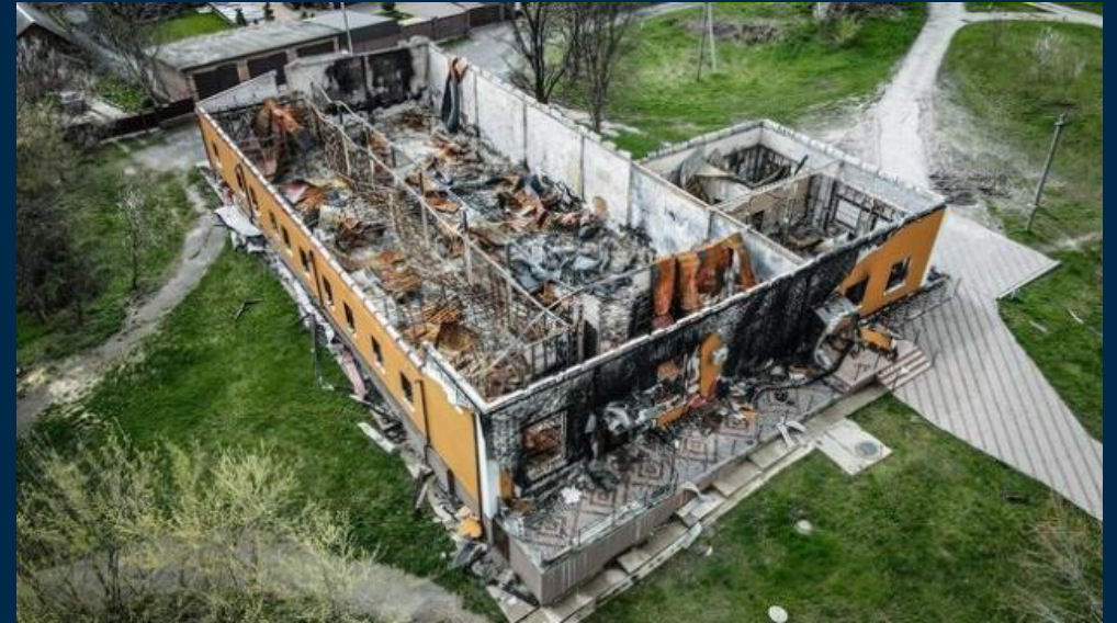
25 February 2022, museum of Mariia Prymachenko in Ivankiv, Kyiv Region