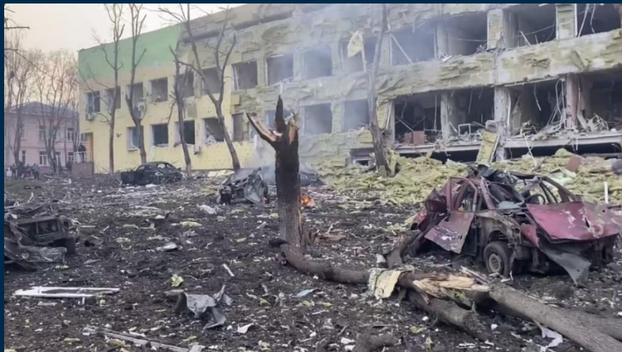
9 March 2022, maternity hospital in Mariupol, Donetsk Region