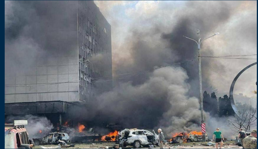
14 July 2022, the business-center in Vinnytsia, 27 killed, 202 injured