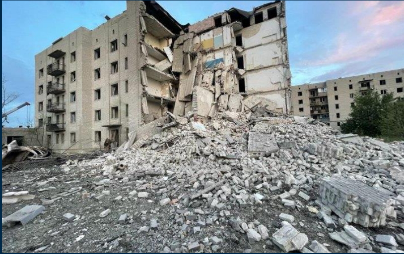
11 July 2022, the residential building in Chasiv Yar, Donetsk Region, 48 killed, 9 injured